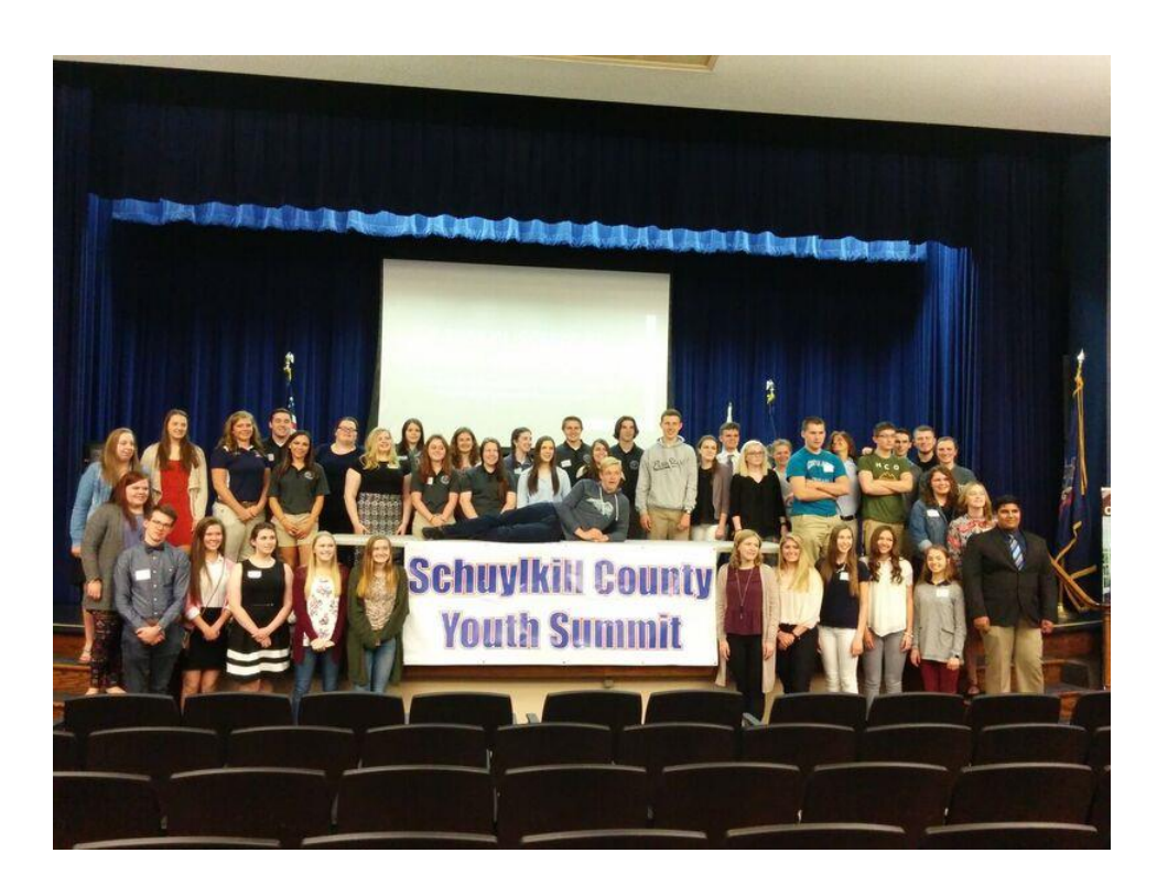
Students attending the Youth Summit at Penn State, Schuylkill Campus

Schuylkill County's VISION serves as the facilitator of the Schuylkill County Youth Summit since its inception. The goals of the Youth Summit are to engage, equip, and support our youth to create a great future for Schuylkill County. Below are some of the ways VISION has facilitated this process in the past year.