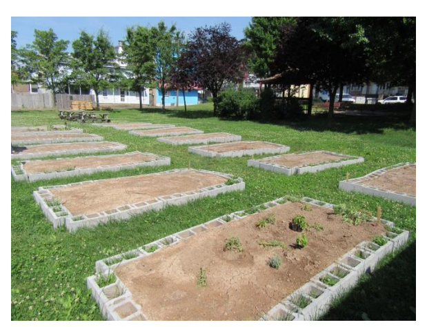
Mahanoy City Community Garden, phase 1