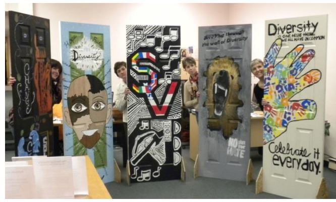
Doors of Diversity